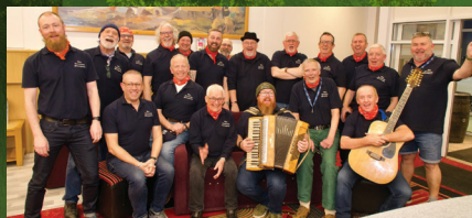
The Causeway Shanty Men