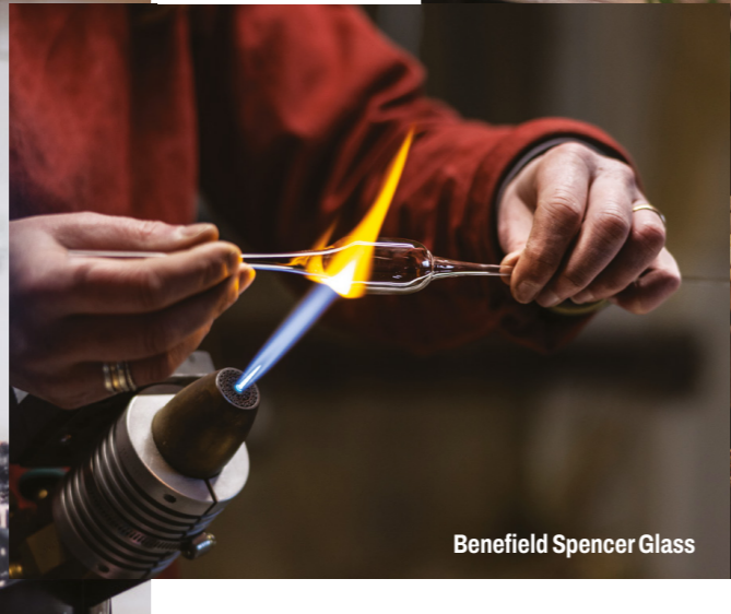
Benfield Spencer Glass