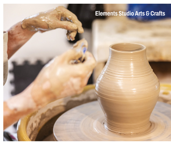
Elements Studio Arts & Crafts