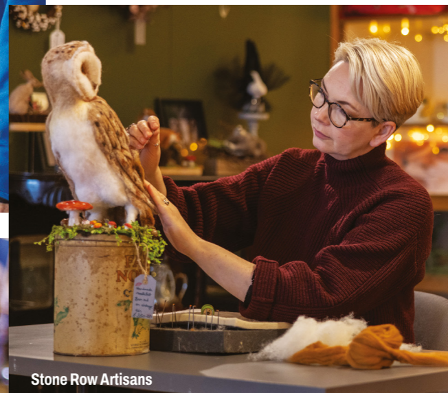
Stone Row Artisans