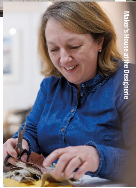
Maker's House at the Designate