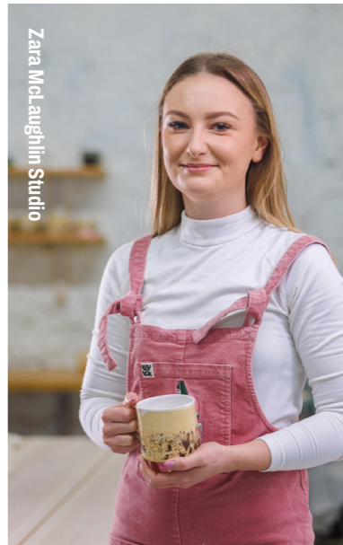
Zara McLaughlin Studio