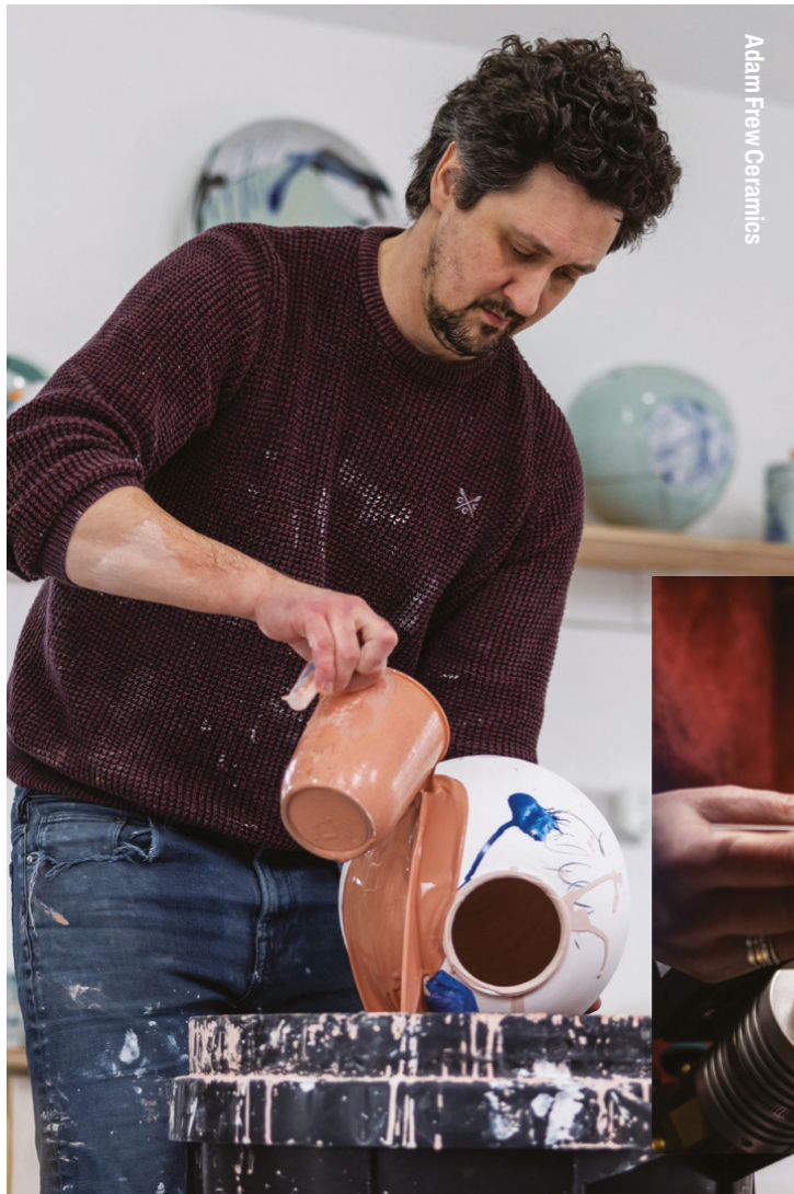
Adam Frew Ceramics