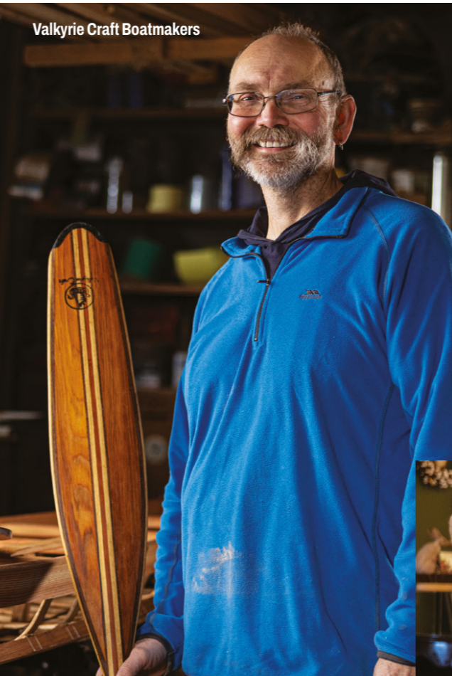
Valkyrie Craft Boatmakers