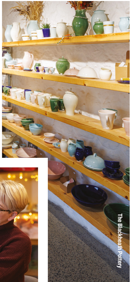
The Blackheath Pottery