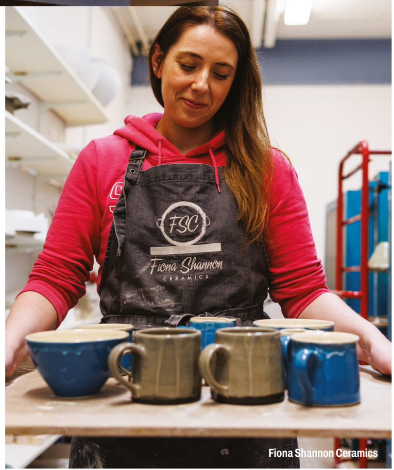
Fiona Shannon Ceramics