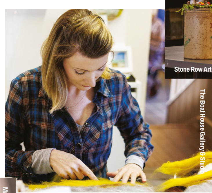
The Boat House Gallery & Studio