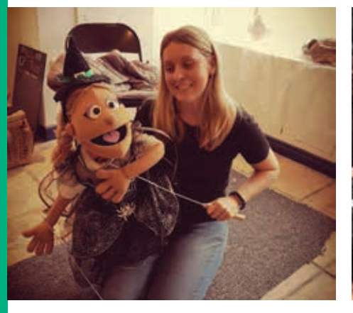
www.big-telly.com facebook @bigtellyni twitter @bigtellyNI

puppets, longest ghost story in the world, tall tales, knitting, poetry, film making, local artists, visiting artists, dog shows, trade secrets, mannequin Mondays - it's all going to be happening in Ballycastle Creative Shop. There are activities for all ages, and everybody is welcome. Passers-by, shoppers, young, young at heart, old hands, new hands literally something for everyone! Keep an eye on Big Telly's Facebook page and website for details of when and where, with events on up to 6 days a week!