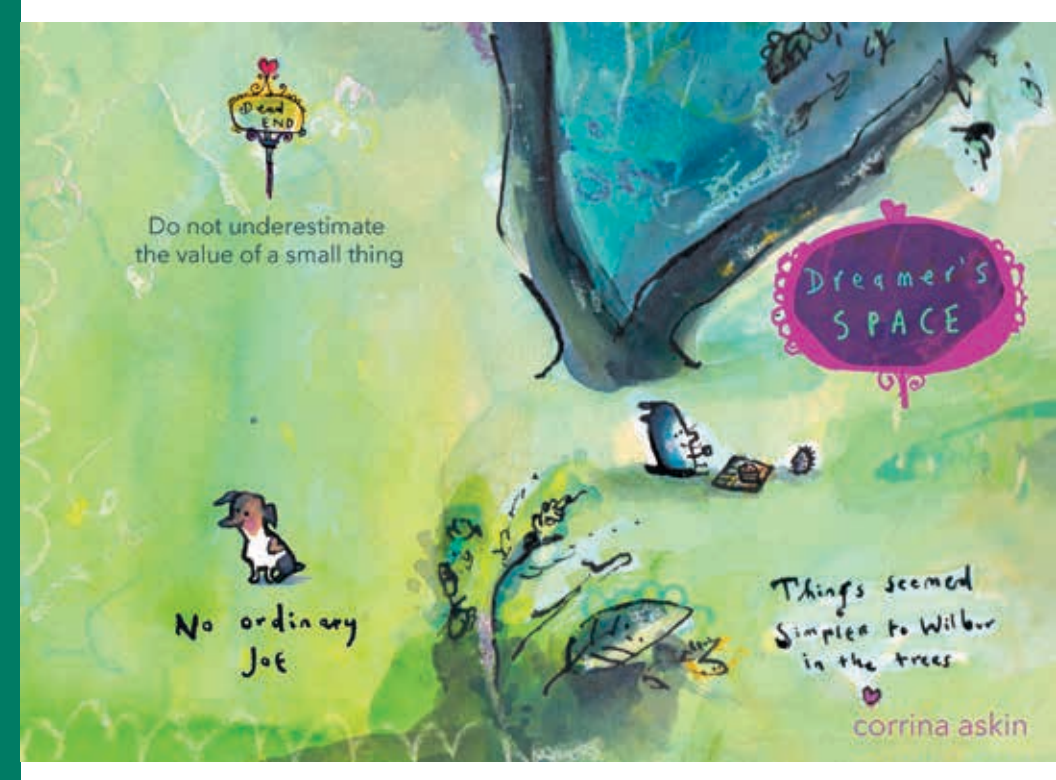
Illustration by Corrina Askin