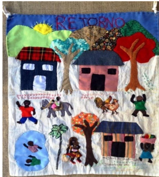
In the arpillera “Return/Retorno” Retorno/Return , (2013)

We can see people returning to their homes and land, after conflict and migration.